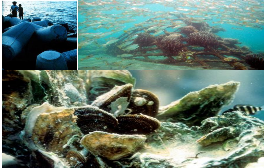
Fig-5. (top left) Conventional shore protection structures on left cost $13M per kilometer. Fig-6 (top right) Biorock structures shown offshore in Indonesia. Fig-7 (bottom) Healthy Bio-Rock oyster reef ecosystem.