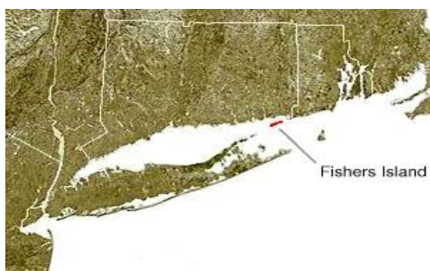
Fig-1. Location of Fishers Island

The immense storm surge and dune erosion has lowered elevation of beaches and near shore areas all along the southern coastline of Fishers Island now more vulnerable to additional storm impacts and future hurricanes. The general consensus from surveys conducted after the storm was that natural barriers such as intertidal and near shore habitats, sand dunes, salt marshes thus speeding their recovery. The proposed Bio-Rock shoreline living reef will improve shoreline resilience as the Eccosolution – Bio-Rock Technology Team effectively constructs and seeds the development of these natural systems.